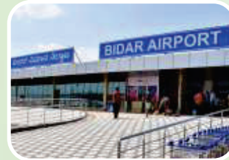
Bidar Airport 30 కి.మీ.లలో బీదర్ ఎయిర్పోర్ట్