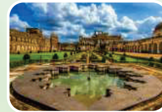
Bidar Fort 25 కి.మీ.లలో గల ప్రసిద్ధ పర్యాటక కేంద్రం