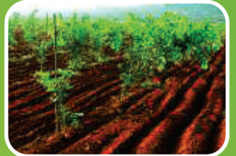
Red Sandal Wood