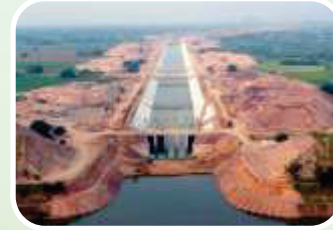
Sangameshwara Basaveshwara Lift Irrigation Project లక్ష ఎకరాలకు నీరునుంచి అందించే లిఫ్ట్ ఇరిగేషన్ ప్రాజెక్ట్