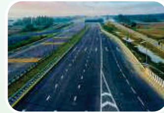
Hyderabad - Nanded Highway తెలంగాణలో మొట్టమొదటి 6 వరుసల జాతీయ రహదారి