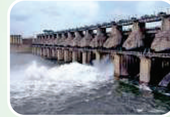
Singur Dam ప్రముఖ మంజీరా నదిపై అతిపెద్ద లజ్జాయర్