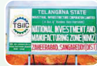
NIMZ - TSIIIC SEZ రెండు తెలుగు రాష్ట్రాలలో అతిపెద్ద ఇండస్ట్రియల్ క్లస్టర్